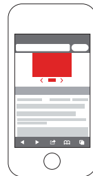
Slideshow Ad (300 x 250 px, max. 40 kB pro Slide)