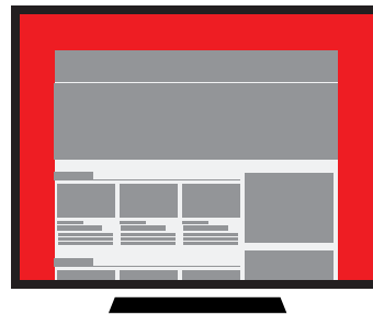
Fireplace* (960 x 100 px, 160 x 600 px, plus hex-color)