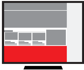
Fishtank* (960 x 900 px, plus hex-color)