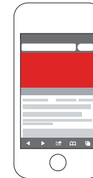
Mobile Content Ad (300 x 250 px, max. 40 kB, HTML5)