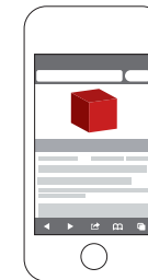
Cube Ad (320 x 320 px, max. 200 kB – for all 4 sides)