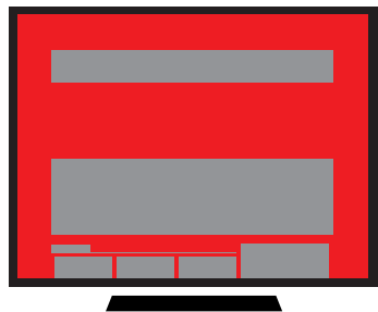
Videowall* (Video behind content, max. 3 MB fullscreen)