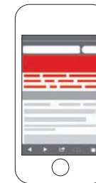
Advertorial Teaser (300 x 250 px, max. 40 kB)