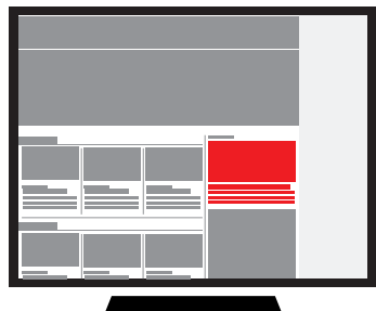
Advertorial Teaser / Sitelink** (300 x max. 140 px)