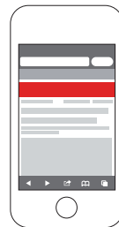
MMA Banner (300 x 50 px, 40 kB)